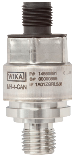
Pressure sensor, model MH-4-CAN