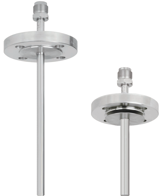
Fig. left: Protection tube with flange, model TW40-8 Fig. right: Protection tube with tantalum cover, model TW40-E

Furthermore, one can differentiate between protection tubes and thermowells. Protection tubes are constructed from a tube, that is closed at the tip by a welded solid tip. Thermowells are manufactured from solid bar stock.