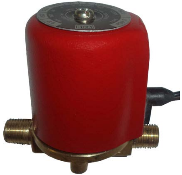
Solenoid valve, model WSV