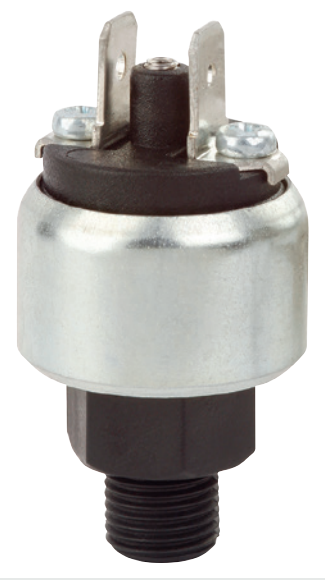
OEM compact pressure switch, miniature format, model PSM04