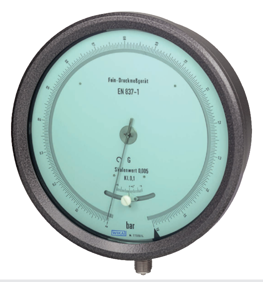
Test gauge series model 342.11