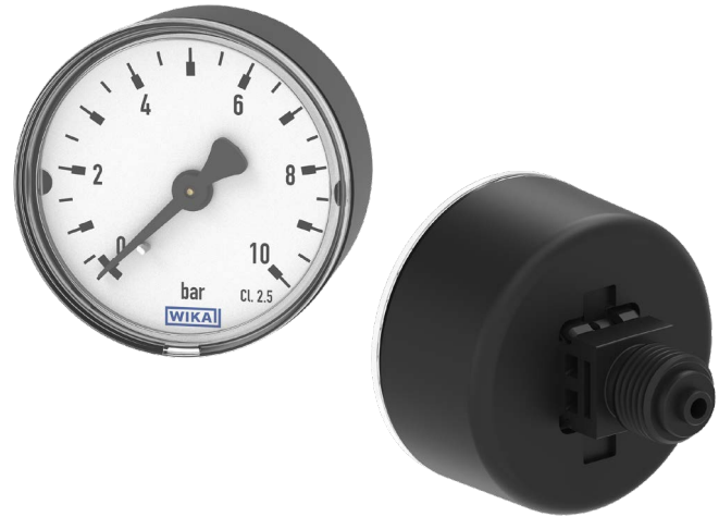
Fig. left: view from the front Fig. right: view from the rear