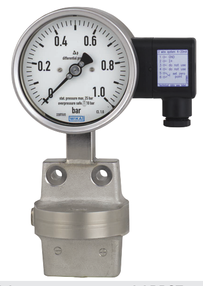
Differential pressure gauge model DPGT43.100