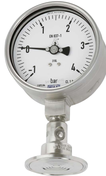
Diaphragm seal system, model DSS22F